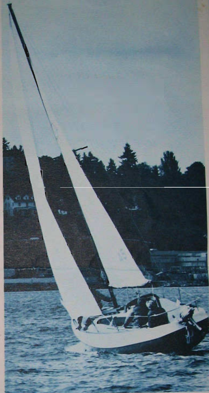
Optional tall rig shown.